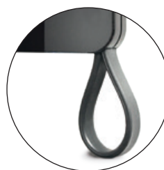
RUBBER KEY RING