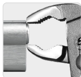
Plug pulling protection